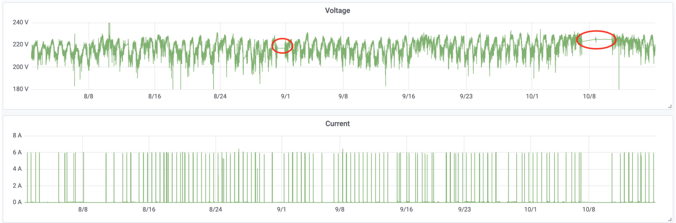
Fig. 3: Voltage and Current recorded by T005 from Aug-01-2019 to Oct-15-2019.